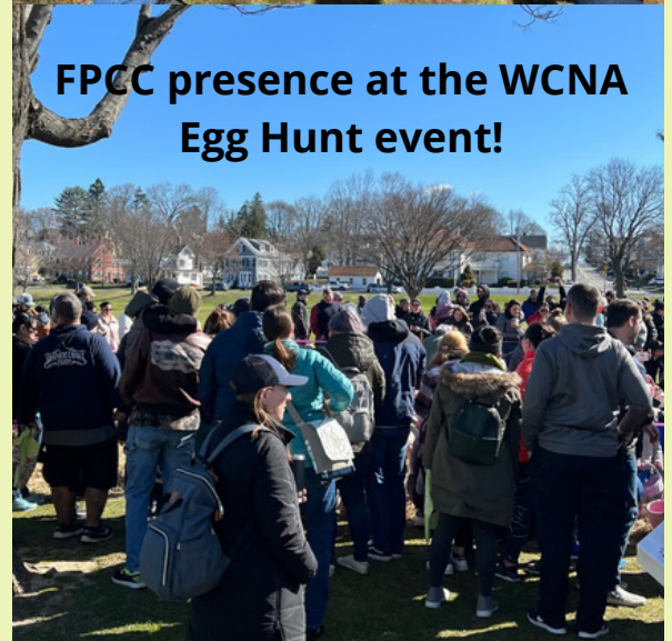
FPCC presence at the WCNA Egg Hunt event!